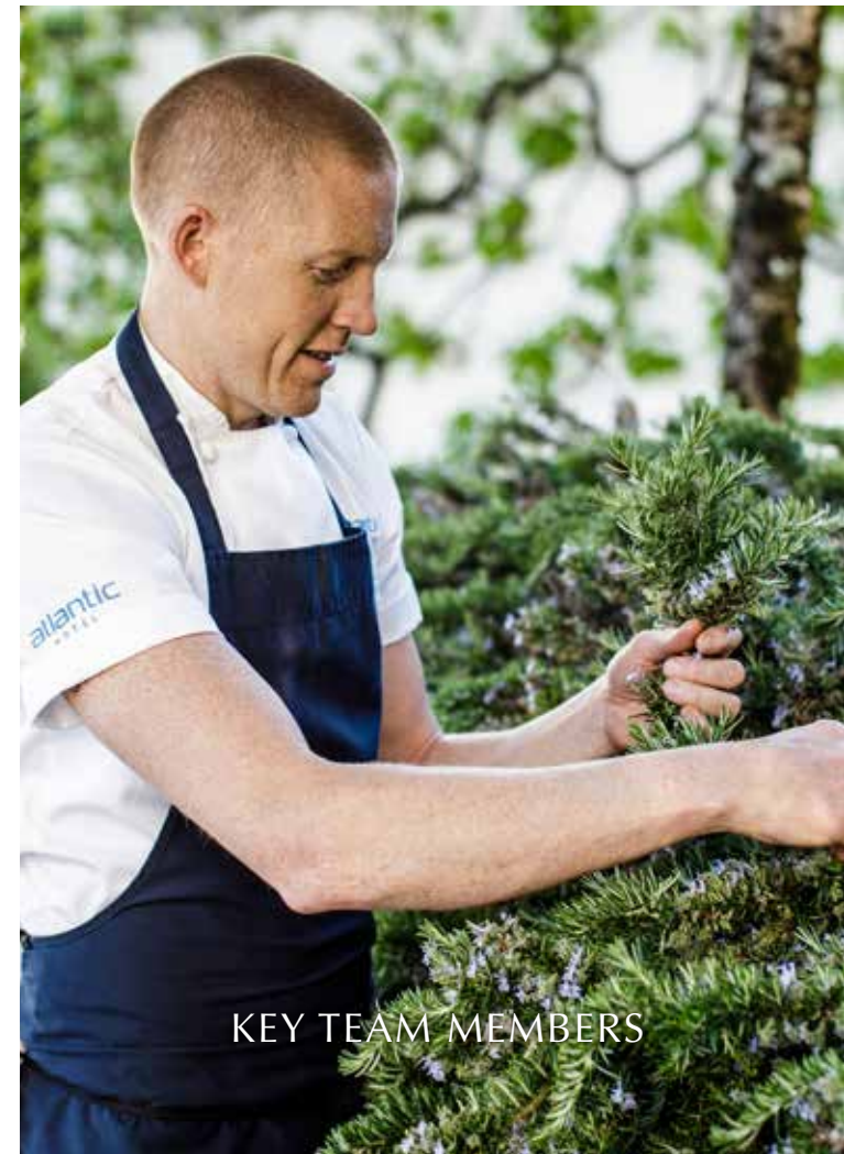
KEY TEAM MEMBERS